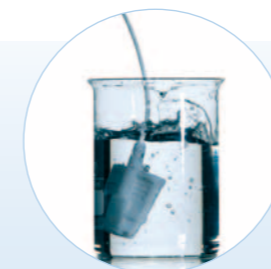
SoftCap® – Simple cleaning and disinfection