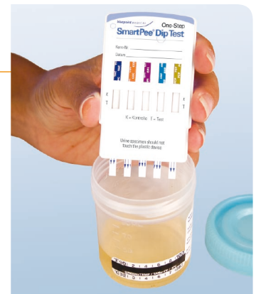
Dip device into collected urine for 15 seconds