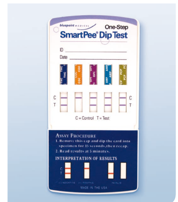
Read results at 5 minutes